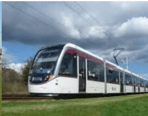
Replacement Edinburgh Tram