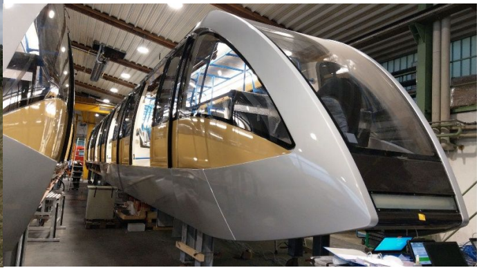
Luton Airport replacement