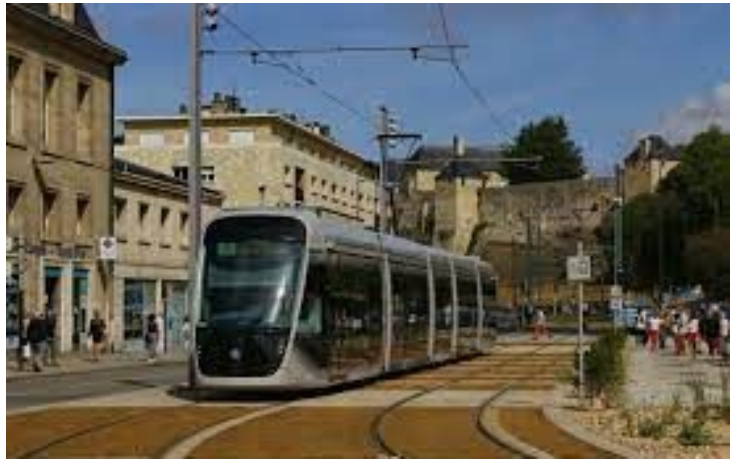
Caen tramway replacement 2029