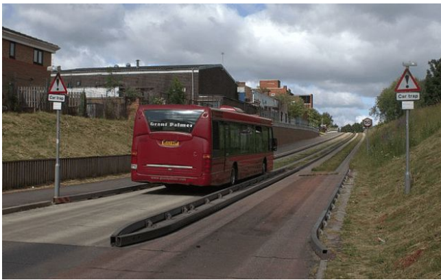
Luton – Dunstable busway

It is noted that this is not very popular with local residents. Luton Airport has decided on a tramway link from the Parkway Station, rather than the planned busway extension. Passenger numbers on the busway are not impressive compared to new tram lines. There is also a poor accident record with buses crashing into each other and the central barrier. Residents have questioned why trams were not one of the alternatives during public consultations.