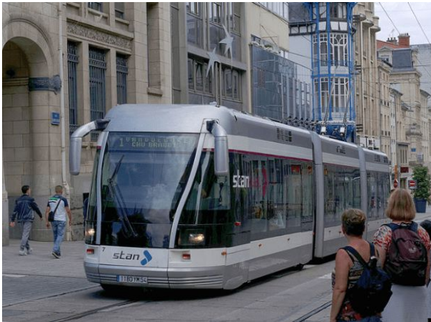
Caen busway, guided by central slot

This proprietary busway was promoted as a tramway on rubber tyres and has been plagued with problems from the start, including 'derailments', spare shortages and costs. The Caen system uses a central slot for guidance and two overhead wires for electric power. The City Council recently decided to convert it to a tramway, noting it would have been cheaper in the first instance.