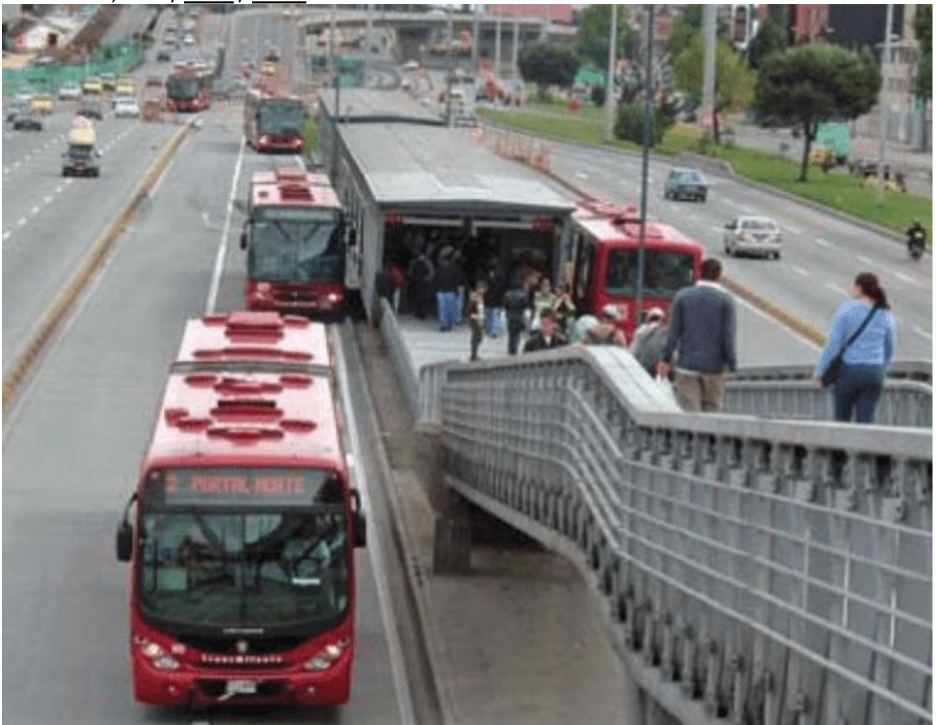
Above: the Curitiba Busway