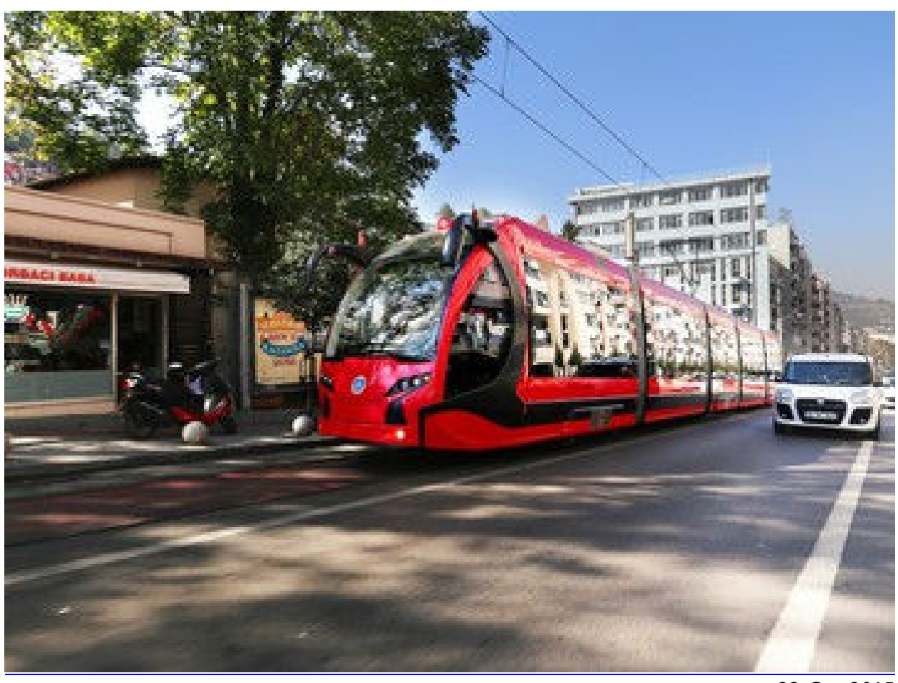
22 Oct 2015

Siemens has in the past worked with Turkish supplier Durmazlar on the Silkworm tram.