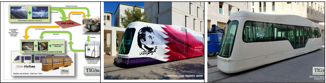
A significant source of low cost Hydrogen is available locally in the Cheshire area

Hydrogen cars no overhead required, running in Doha Qatar Dec 2018