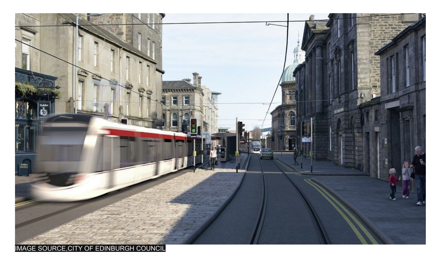
Work began on the £207m extension in November 2019. Currently, the line begins at Edinburgh Airport and ends at York Place. Night trials along the extended route took place over a week in March.

Now we're all set to build on past successes as we enter a new era for both the tram and our fantastic city as it looks to a prosperous, greener, and even better-connected future," Lea added.